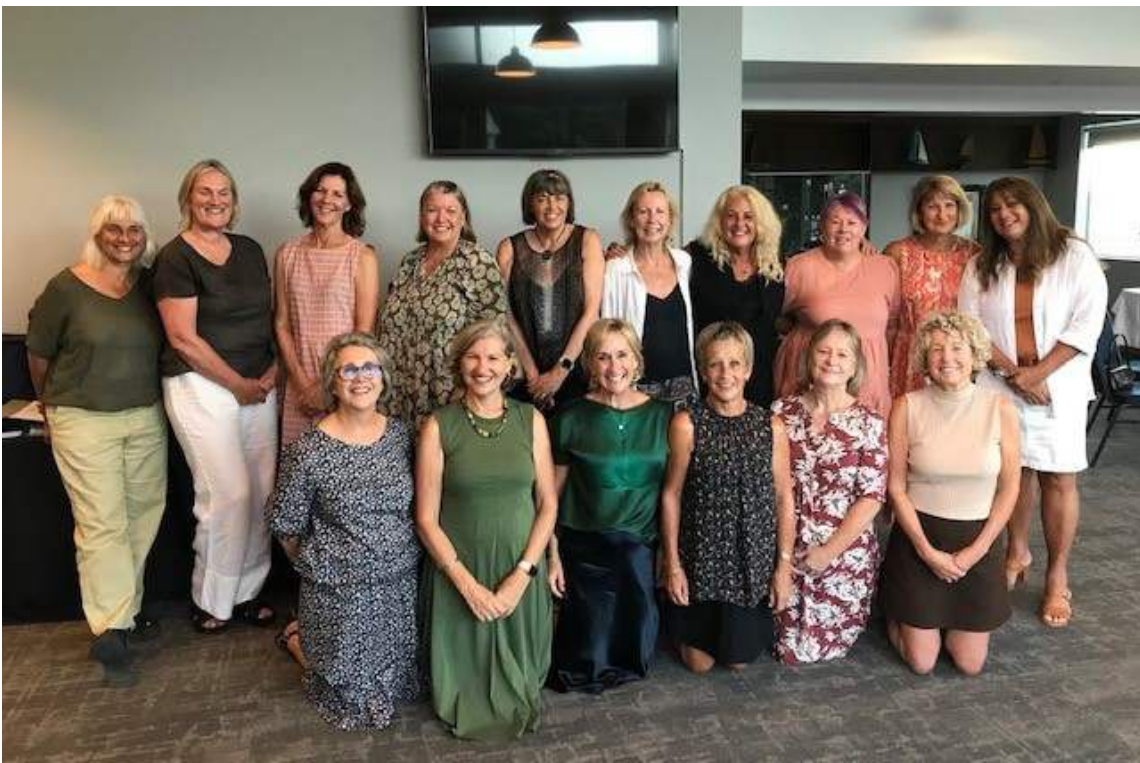
Class of 1977 Reunion